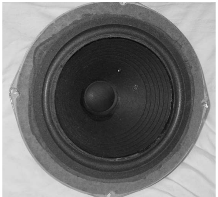
The Advent Low-Frequency Driver

The efficiency of the system has been carefully chosen to provide for reproduction of the lowest usable frequencies with amplifiers and receivers of good quality and medium power. While efficiency is lower than that of some comparably priced speakers of more limited range, and will require a slightly higher setting of a volume control for the same acoustic level, it is no more likely to tax the actual power capabilities of the amplifier or receiver used in a home. This doesn’t hold for auditoriums or, in many cases, for large (and sometimes noisy) audio showrooms, but it is emphatically so for home listening at even the highest usual loudness levels.