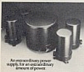
An extraordinary power supply for an extraordinary amount of power.

Inside the SX 1250, for example, you'll find that we took the time to shield every critical section. So spurious signals from one section can't leak into another. And dirt and dust can't get in to affect performance. So the SX 1250 not only produces