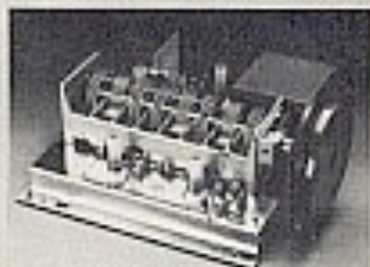
A five gang variable capacitor for FM reception that never varies.

And where most high powered receivers come with a three, or four gang variable capacitor for FM tuning, the SX 1250 features a five gang zinc plated variable capacitor that cleans up FM reception much better. And helps to pull in stations that some three or four gang capacitors can't even touch.